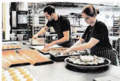
Cook like a chef!

3 Task 3. You are going to give an interview. You have to answer five questions. Give full answers to the questions (2-3 sentences). Remember that you have 40 seconds to answer each question.